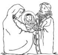
Nativity of the Blessed Virgin Mary

St. Pius Catholic Church, Troy, IN, will have their annual Fall Festival on Sunday, September 12. Their menu includes their Famous Soup, by the bowl and gallon, Fried Chicken or Roast Beef Dinners, Hamburgers, Polish Sausage, and Homemade Pies. Entertainment includes the CROSSWIND Band, a Giant Yard Sale/Flea Market, Games for Adults/Children and a Raffle. Serving begins at 11:00AM CDT. Please bring your own container for carry out soup. License # 121630.